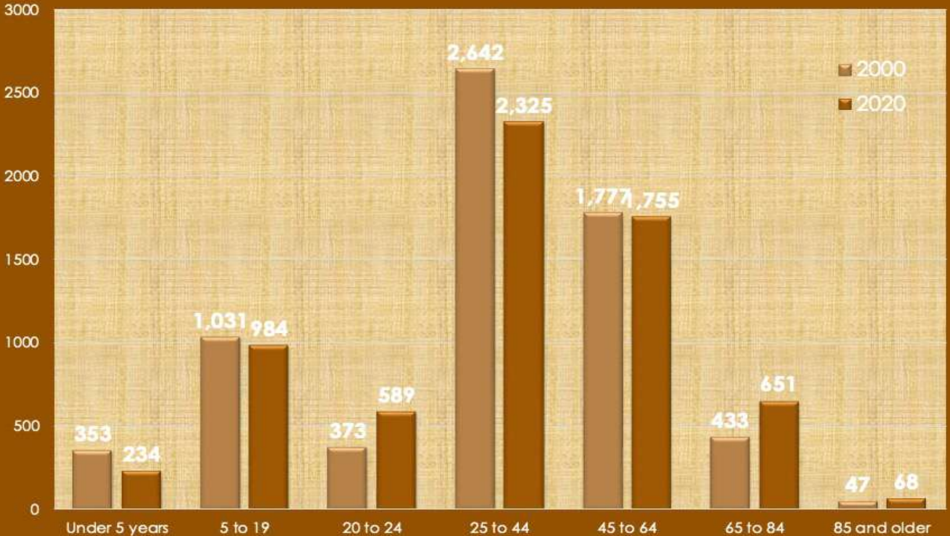
Population Series by Age Group: 2010 & 2019