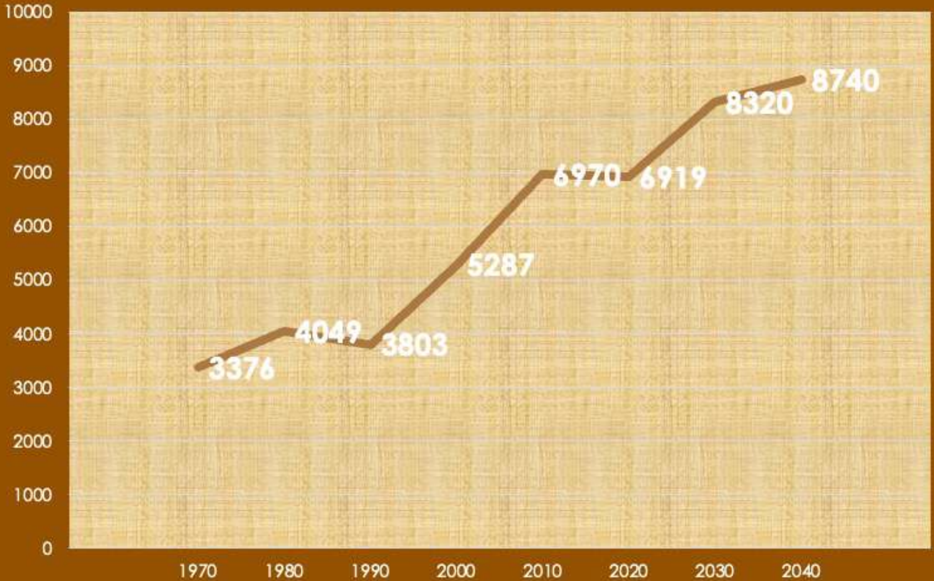
Population Series: 1970-2040